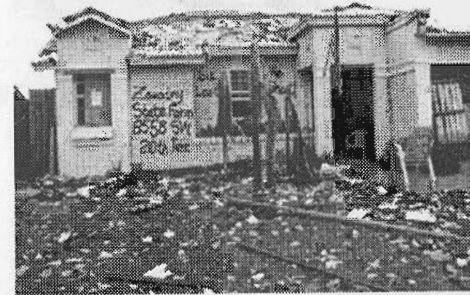
Level 3 - Major damage; uninhabitable